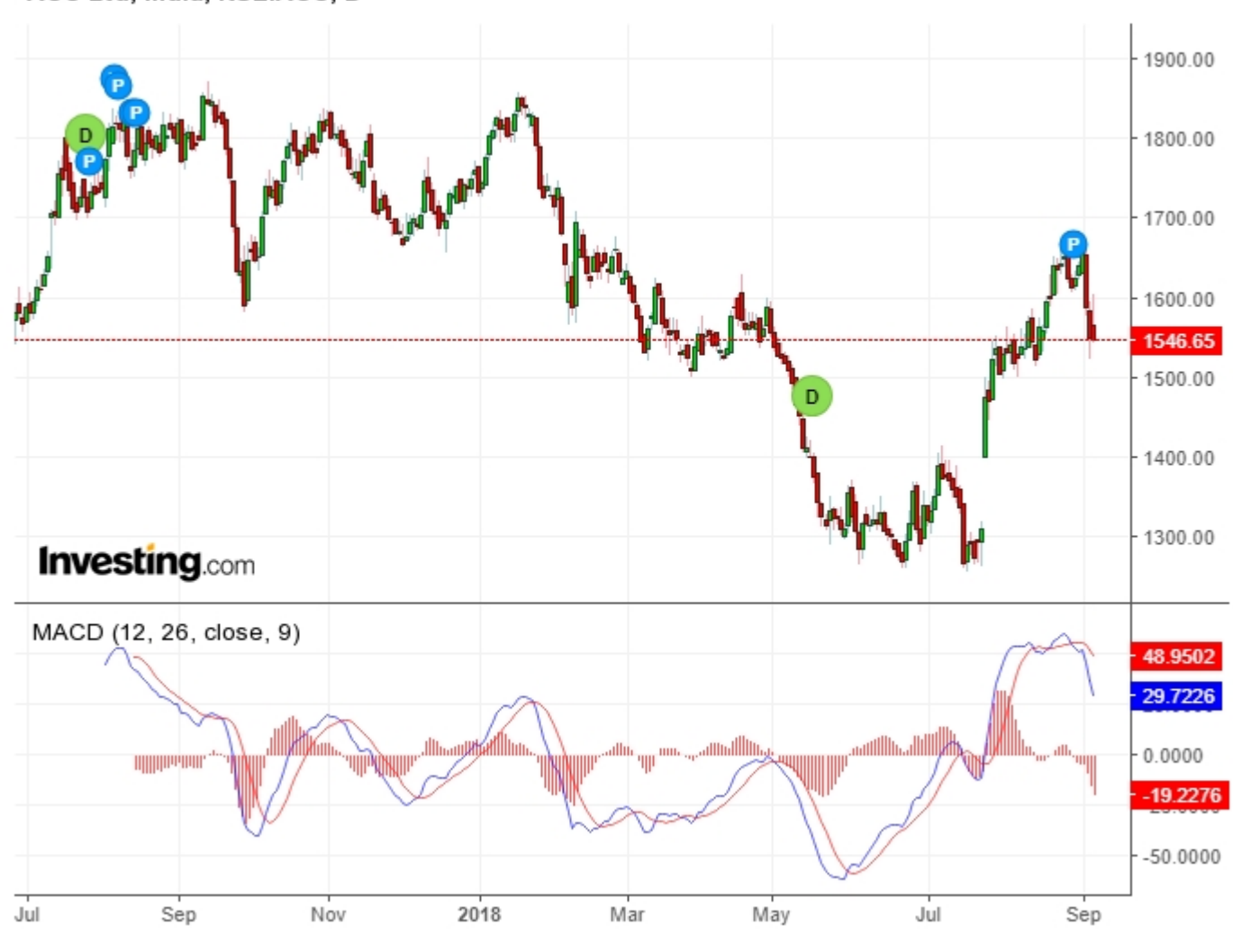
ACC Ltd, India, NSE:ACC, D

Published on Investing.com, 6/Sep/2018 - 7:32:11 GMT, Powered by TradingView.