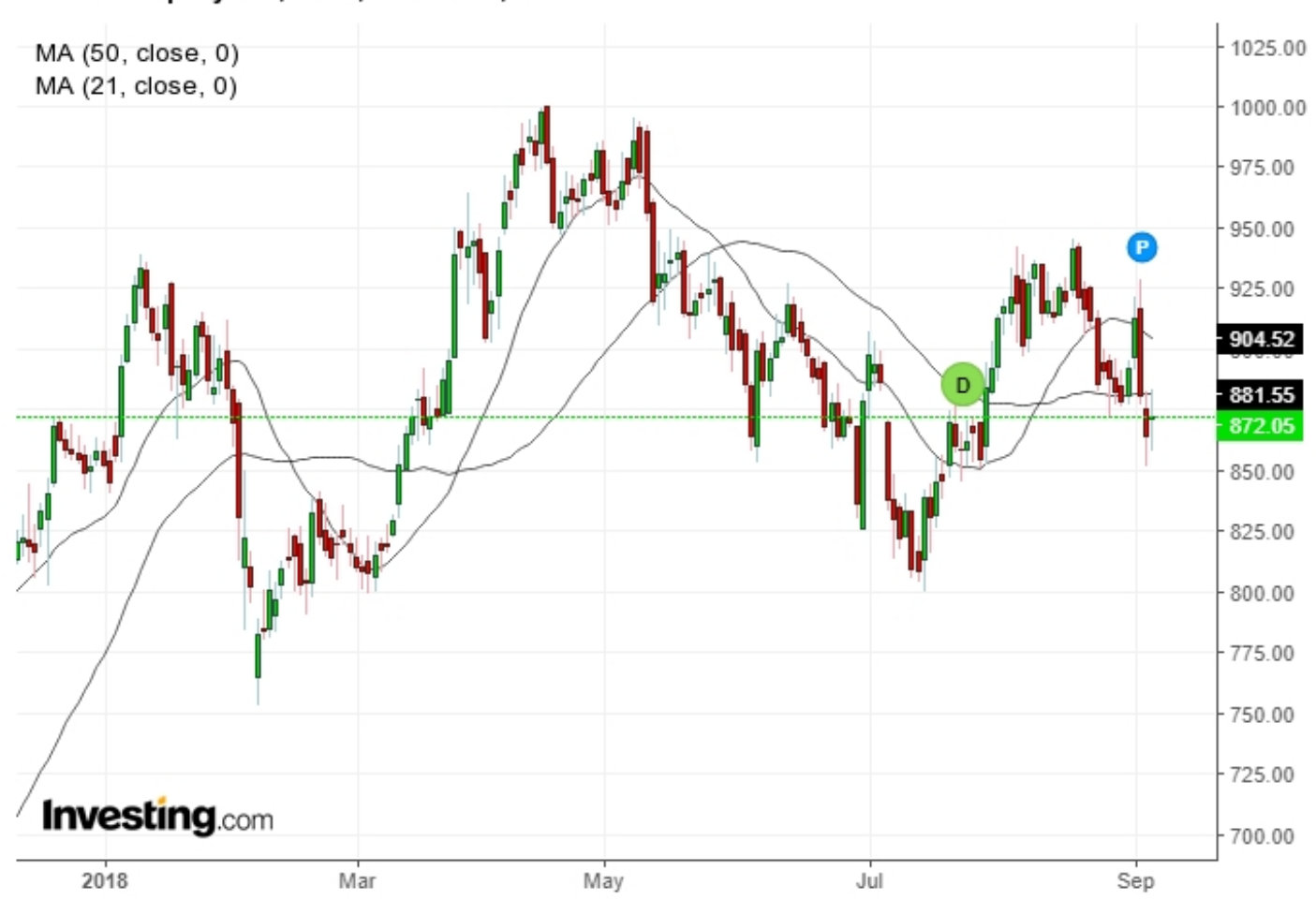
Chart 5: ACC